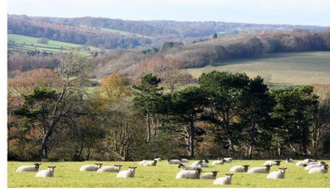
View over the Misbourne Valley from Mulberry Park Hill, in Potter Row. The house will still be demolished and the AONB devastated by the proposed route

REPA (the Residents' Environmental Protection Association) is an association of 12 local groups who joined forces in 2013 to do something about the dire consequences of HS2 on their communities of South Heath, Potter Row, Hyde End & Hyde Heath.